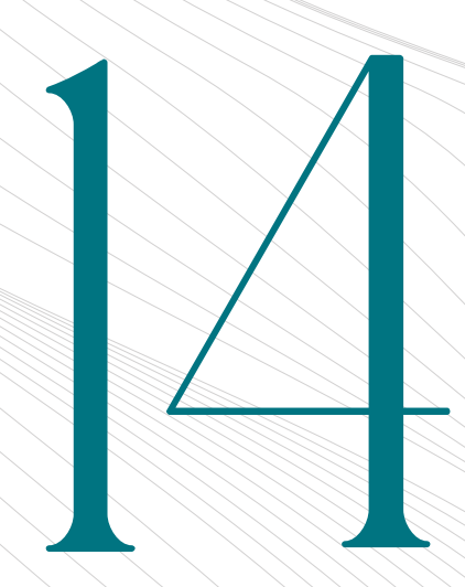
RESIDENCE 14 LEVELS 14-47